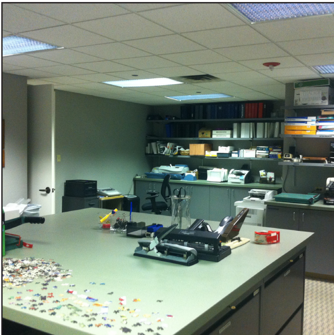
Common Area – Copy Room