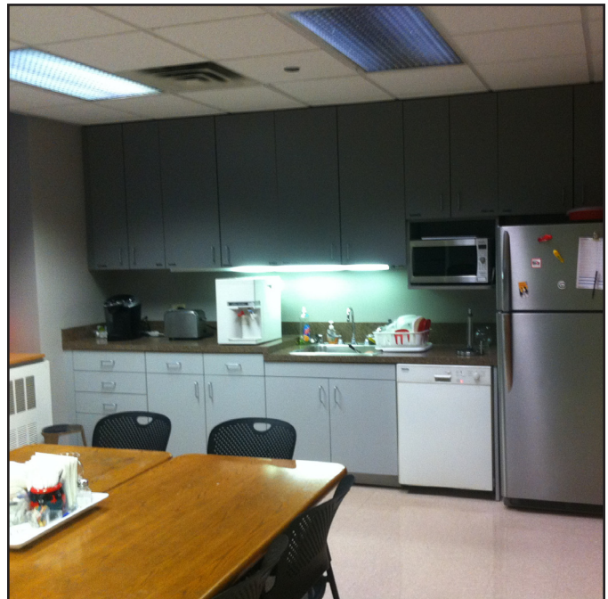
Common Area – Kitchenette

Disclaimer: Millennium Properties R/E is the owner's designated agent and makes no warranties or representations as to the accuracy or completeness of the information contained herein. The information has been obtained sources deemed reliable; however, it is up to the purchaser to conduct due diligence prior to sale.