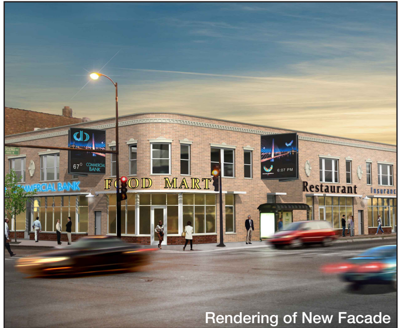
Rendering of New Facade

Located at North and Cicero, this property is located within a strong retail corridor on the west side of Chicago. A wide variety of local and national retailers have stores nearby including Walmart and Walgreens.