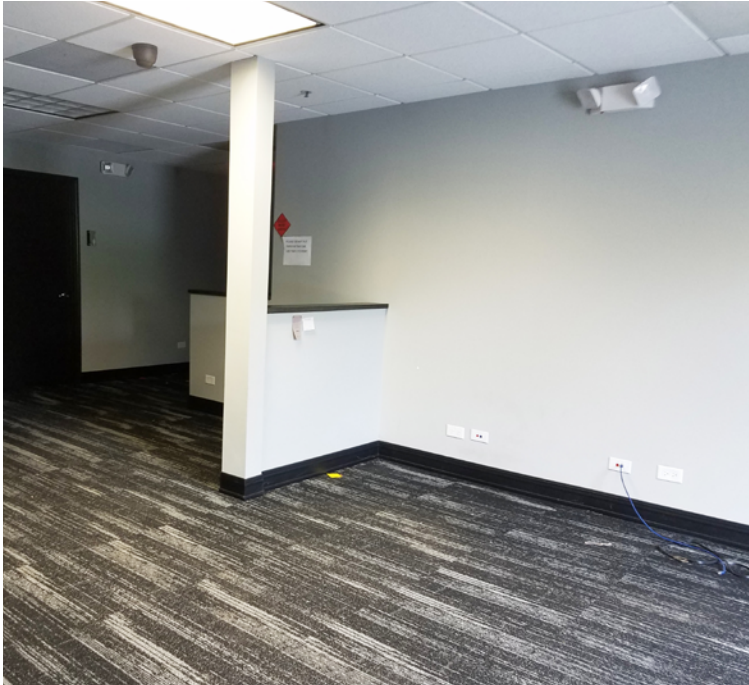
Reception and Large Open Area