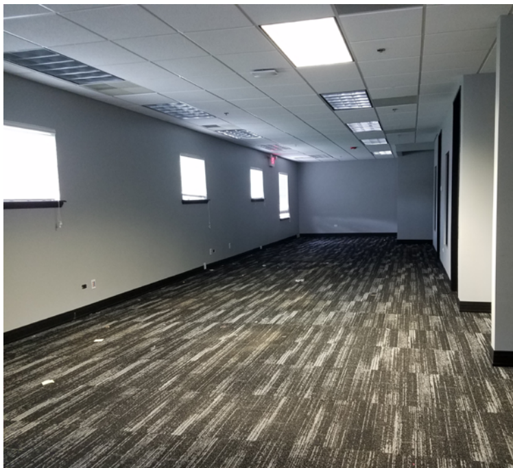
Large Open Area