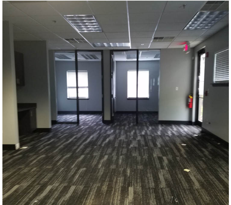
Two Private Offices