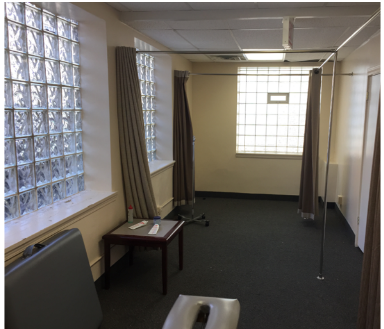
Large Open Area