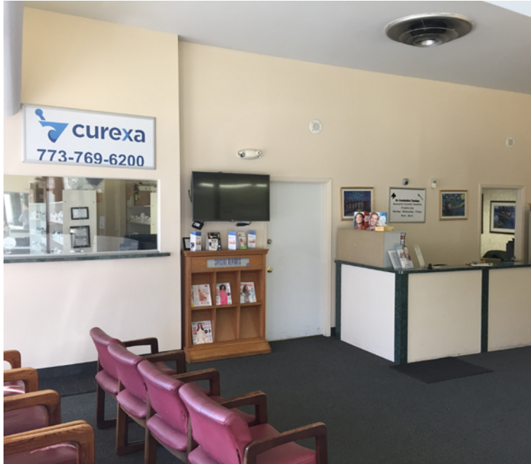
Shared Waiting Room