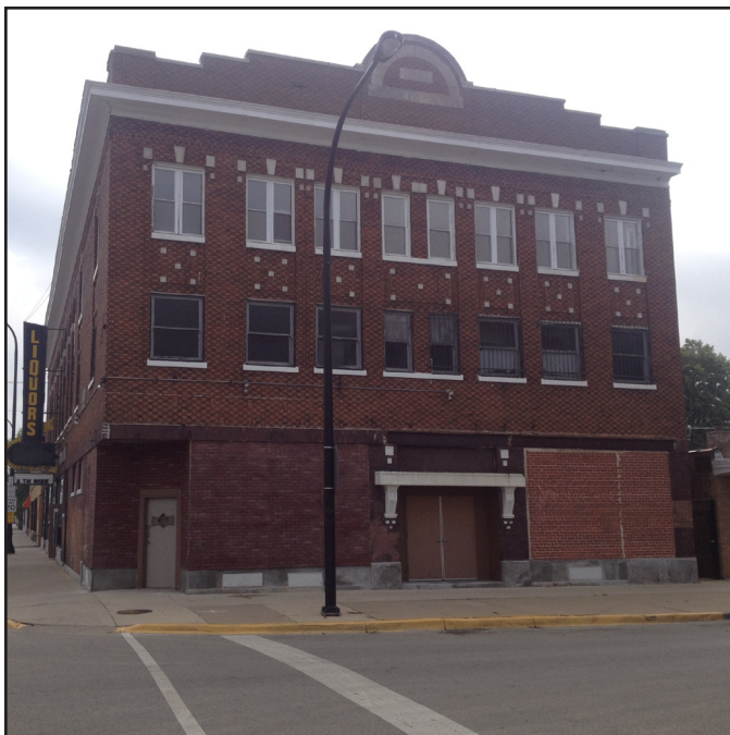
Corner Retail Storefront