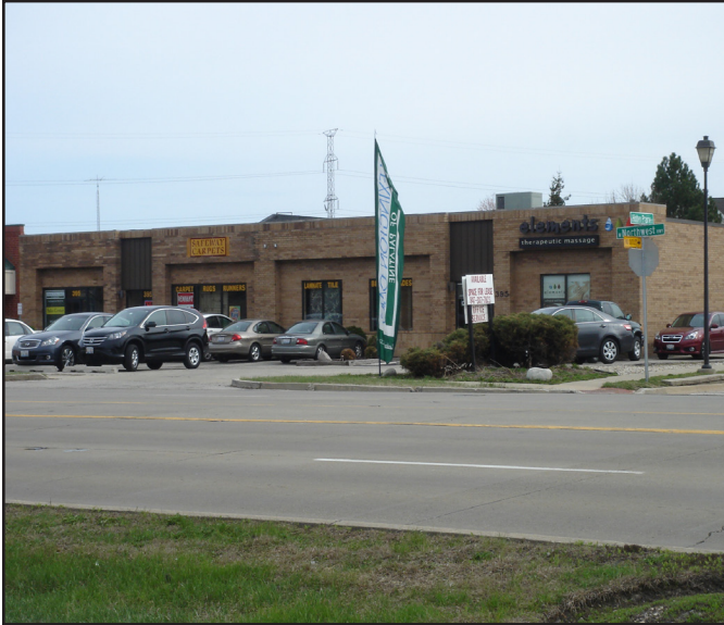
View from Street