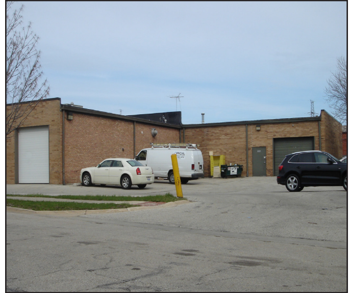
View of Loading Area