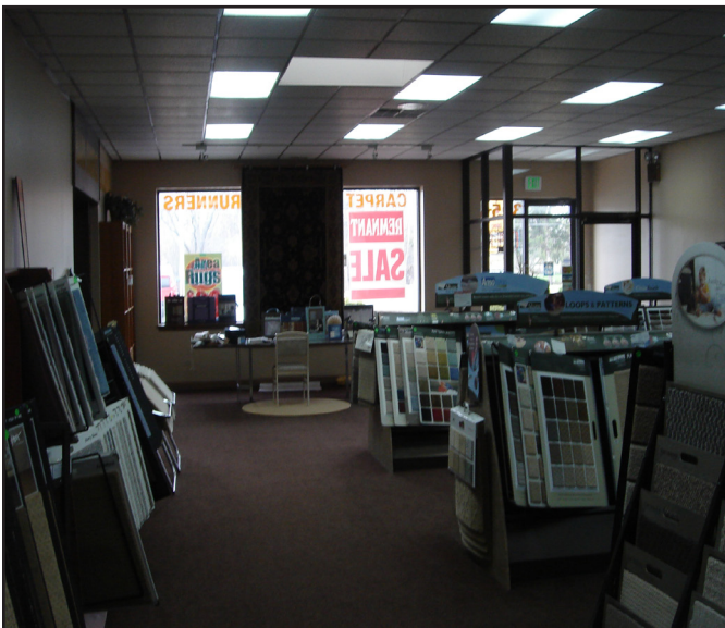
Interior Retail Space